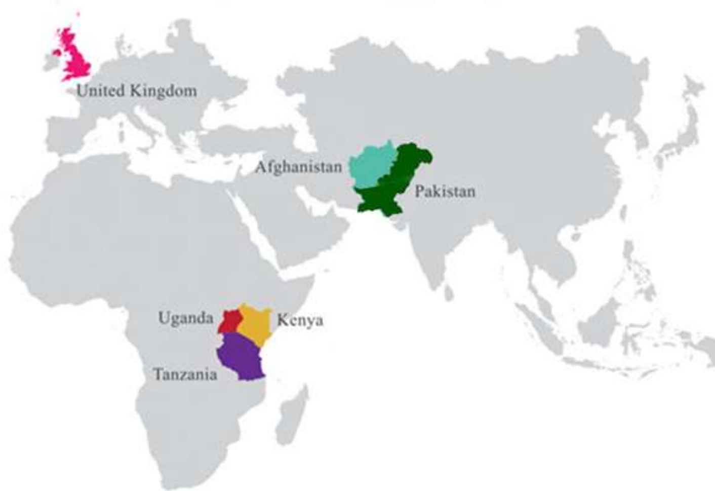
CAMPUSES AND TEACHING SITES