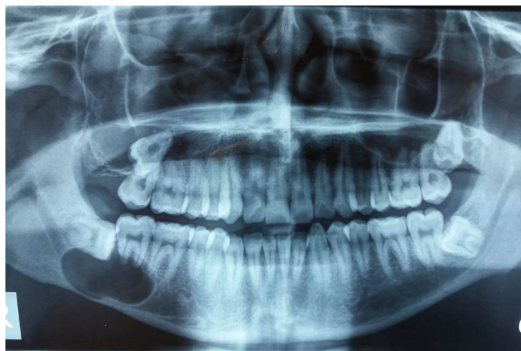
Fig. 1 Panoramic view shows a well-demarcated unilocular radiolucency in right angle of mandible. Impacted 3rd molar tooth is seen superiorly

Follow up was available in 8 out of 10 cases. Follow up periods in these patients ranged from 7 months to 62 months. All 8 patients were treated by enucleation. All 8 patients were alive and well with no recurrences. None of the patients received any additional treatment. (Table 1).