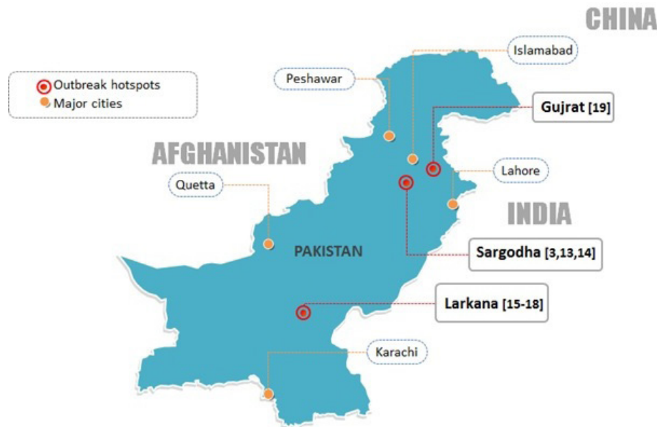
Figure 1 Map of Pakistan showing hot spots of reported HIV outbreaks.

continue to be a major hurdle in any future efforts for harm reduction. According to a United Nations Programme on HIV/AIDS 2017 survey, condom usage was low among major high-risk groups, such as transgenders (24%), injection drug users (15%) and men who have sex with men (22%). Knowledge about HIV prevention among young men and women (aged 15–24) was, respectively, 5.2% and 4.2%. 10 The rate at which the epidemic is currently growing in the rural areas alludes to serious gaps in the harm reduction efforts. It is imperative to educate vulnerable masses in the rural areas about treatment and further prevention of transmission. Considering that a major part of the infected population is younger individuals, it is important to target harm reduction efforts to that particular group. In the face of prevailing unawareness, not only the epidemic will continue to spread but will likely give rise to HIV variants that may be hard to treat.