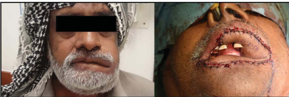
Figure-2: Post op at 3 months and immediate post op. The flap design incorporated into the defect over upper lip, lower lip, oral mucosa and cheek skin. At 3 months the aesthetic appearance of the patient is satisfactory.

circumferentially from the upper lip and lower lip. The extension of skin from the part which would form the oral commissure almost perpendicular to the original strip, would form the buccal mucosa.