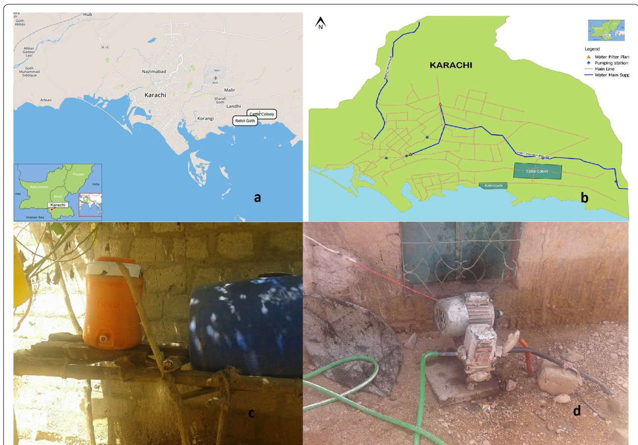
Fig. 1 Study areas in Karachi and water supply and consumption; a Map of Cattle Colony and Rehri Goth in the Bin Qasim Town of Karachi (Insets show location of Karachi within Pakistan and Pakistan in South Asia); b water distribution system in Karachi showing piped water supply to study areas from a natural lake east of Karachi; c water storage tanks used in some households; and d pressure booster pumps used by consumers to overcome low pressure and intermittent supply of piped water

Cattle Colony (CC) and Rehri Goth (RG) are peri-urban localities around cattle-farming and fishing communities, respectively, in the Bin Qasim town of Karachi (Fig. 1a). The sites were included in the Global Enteric Multicenter Study as surveillance sites for diarrhea in children and have an established Health and Demographic Surveillance System. The sites receive piped water supply from the Kinjhar lake system (Fig. 1b).