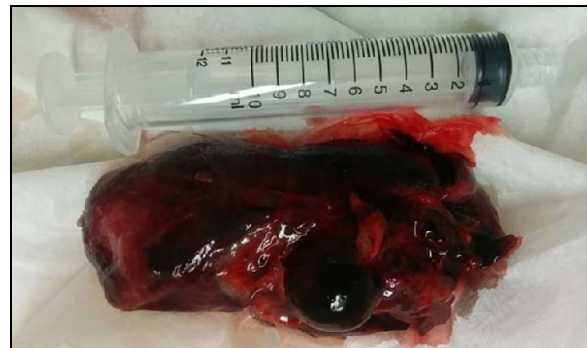
Figure-2: Mass as seen at the time of expulsion.