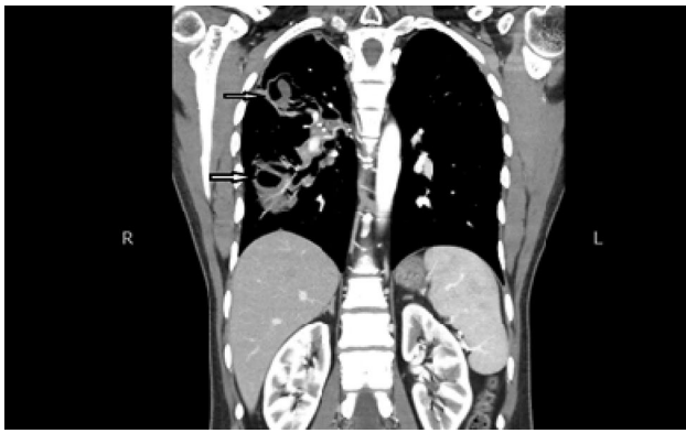
Fig. 1 Computed tomography scan of chest; arrow showing thick walled cavities with air-crescent sign

cavities in right lung. The smaller one was in right upper lobe, ( 4.2 \times 2.4 cm) with a fungal ball. The larger cavity ( 10 \times 4.5 cm) was in right lower lobe having a large fungal ball ( 47 \times 29 mm), extending across major fissure to involve upper lobe as well. Both of these cavities were