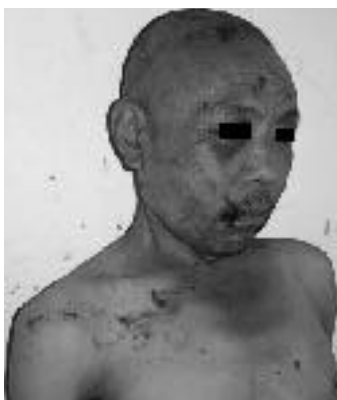
Figure 1: Photograph showing multiple abrasions on scalp and shoulder, and over the right clavicle.

respiratory rate was 24 per minute. His chest and cardiac examination were normal, except for mild in-drawing of the intercostal muscles. There were no focal neurologic deficits. Local examination showed crepitus and tenderness over both clavicles and tenderness over both sides of the chest in the upper part. There was a lacerated wound (1 x 1 cm) over the right parietal region, with ecchymosis of the right eye (Figure 1). There were multiple abrasions over the right clavicular region, as well as both upper and the left lower limbs. Chest X-ray showed bilateral clavicle fractures, bilateral first rib fractures, and right second rib fracture (Figures 2 and 3). Cervical and dorsal spine X-rays were normal. Brain CT scan showed right basal temporal and right fronto-parietal extradural haematomas with mass effect and midline shift (Figures 4 and 5). The patient was treated successfully and did well.