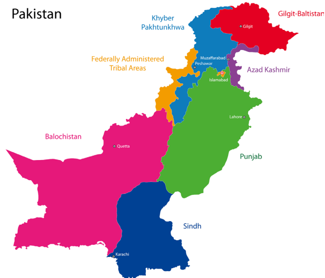
Figure 1. Map of Pakistan, Provinces and Federally Administered Territories.

Keeping in view the gaps in information, we analyzed the most recent PDHS 2012-2013, to determine the factors that affect ANC utilization in Pakistan. We utilized adapted Anderson's model for healthcare utilization (a well-studied and tested