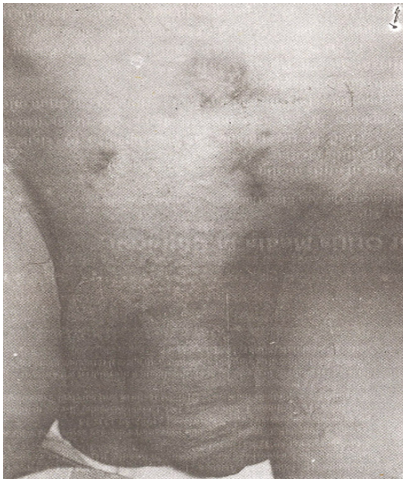
Figure 1. Multiple nodules and discharging sinuses on lower abdomen, scrotal and penile skin.