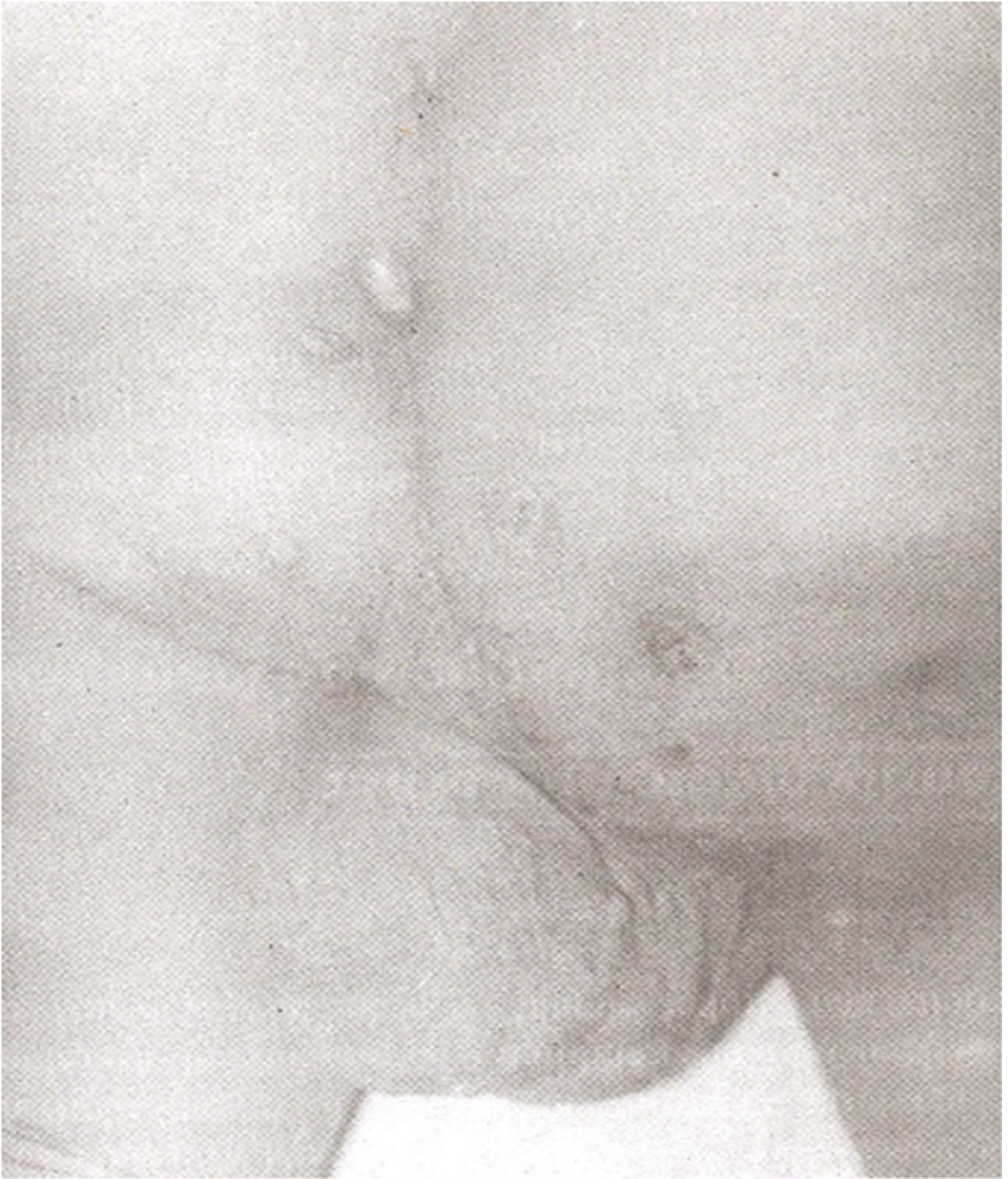
Figure 2. Nodules and sinuses involving the buttock and scrotum.

These lesions had gradually appeared over a period of 10 years. The regional lymph nodes were not enlarged. General physical and systemic examination was unremarkable. Preliminary investigations showed normal X-ray chest, haemoglobin level of 14.2 G%, ThC 8,200/mm 3 and ESR of 79 mm in first hour. X-ray lumbar and sacral spines showed degenerative changes in pelvic and hip joints as