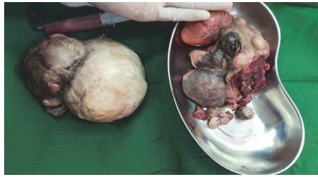
FIGURE 2: Matted Necrosed Myomas and the uterus (d) after extraction from the subtotal hysterectomy.

secondary wound closure. Her wound swab had a positive culture of Klebsiella pneumoniae sensitive to Meropenem which she was started on postoperatively. She recovered as an inpatient for a further 10 days and was subsequently discharged after 16 days of admission.