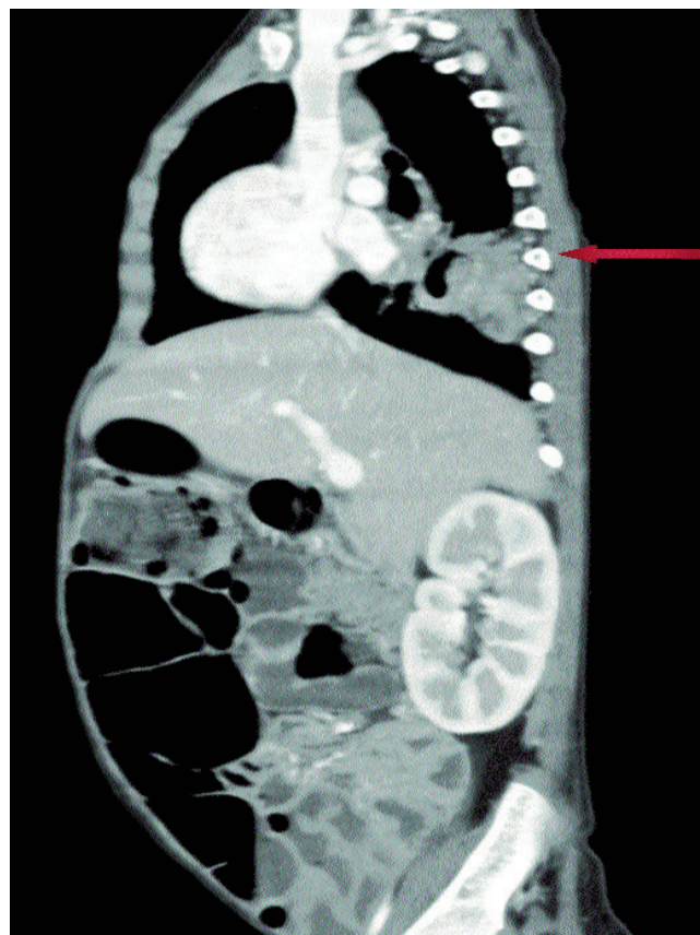
Figure-1: CT angiogram suggesting paraspinous mass in the right chest.

A two-and-a-half year-old child presented with complaints of repeated episodes of haematemesis since the age of 3 months. There was no associated history of fever or jaundice, nor any family history of chronic illnesses like tuberculosis or hepatitis. The parents consulted multiple doctors for the complaint, and he was extensively worked up for chronic liver disease and portal hypertension. Complete blood count was