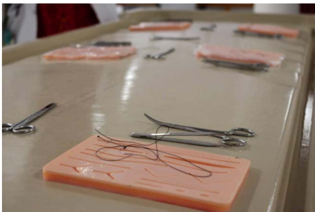
Figure-3: Suturing and Knot-Tying workshop setup.

Other skill development workshops introduced recently include surgical etiquette and Foley catheter insertion workshops with 30 and 100 participants, respectively. The former was designed to guide students on how to ace their surgery rotations. It taught wound dressing, wet and dry scrubbing techniques, and preparation of patient lists. The students also learned about different ways to assist their teams during surgical rounds and in the OR. For the Foley catheter insertion workshop, we borrowed a mannequin from AKU's Centre for Innovation in Medical Education (CIME). A urology resident volunteered his time to teach during the workshop. The workshop divided attendees into smaller groups and included a demonstration followed by practice sessions for each group. Apart from the skill development workshops, two