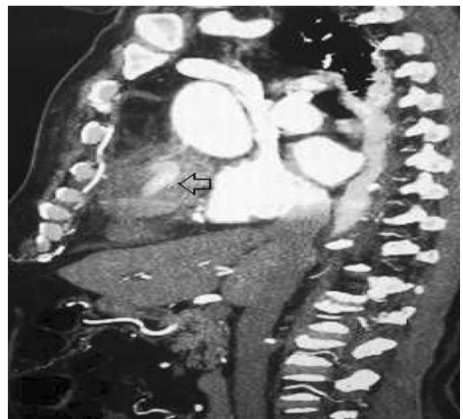
Figure-1 A: CT scan of the chest with contrast showing pseudoaneurysm of reverse saphenous graft aneurysm.

A 76-year-old man with hypertension, ischaemic heart disease, and chronic kidney disease who had undergone coronary artery bypass grafting (CABG) 10 years ago presented to the ER. The initial postoperative course of CABG was complicated by mediastinitis which was treated conservatively. The patient remained asymptomatic for five years but developed localised discharge from the sternal wound which was treated by removing the sternal wire. The patient did well for next five years. He then presented to the ER with the history of right sided chest pain, shortness of breath and fever. ECG showed ST depression in lateral leads and trop-I was mildly leaking. He was treated medically for NSTEMI, acute kidney injury and urinary tract