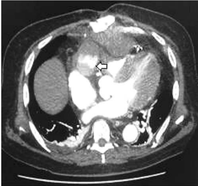
Figure-1 B: CT scan of the chest, a cross section showing pseudoaneurysm.