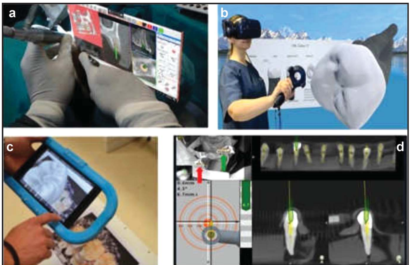
Figure-3: a) The view of the surgeon while performing a surgery with HoloLens glasses. b-c) Application of augmented reality (AR) in learning dental morphology (Image Target and the augmented scene); d) Performing endodontic access cavities (green cylinders) controlled in all planes and depth with fixed black-and-white tag (red arrow) attached to high-speed hand-piece (green arrow).

True implant orientation and position could be assessed by 3D visualisation in AR. This can be the potential future for dental implant surgery owing to simpler procedure and operating time in dynamic navigation outcome. 8 Treatment planning that takes place in the virtual world allows the operator to place virtual implant by interacting with individual patient's anatomy with a degree of freedom prior to performance of the procedure 27 (Figure-3a) or during the procedure. 28 This is simulated in real time and thus feedback for adjustment can be immediately given for accurate placement. Moreover, implant sizes can be chosen with regard to patient's bone quality and quantity that can be visualised in the VR environment and with in-situ image guidance. 28