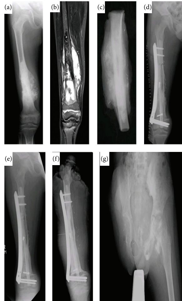
FIGURE 1: A 10-year-old boy with osteogenic sarcoma. (a) X-ray shows lytic mass in right distal femur. (b) MRI shows osteoid lesion in the metadiaphyseal region of right distal femur. (c) X-ray of the resected bone. (d) Immediate postoperative X-ray. (e) X-ray shows graft and host union at both proximal and distal ends 10 months post-operatively. (f) 3-year postoperative X-ray shows local recurrence. (g) X-ray after disarticulation of right hip.

Primary advantages of autoclaved reimplants are that the implanted bone segment is a "custom fit" being the patient's, own bone; no bone banking techniques, costs, immunological response, or transmission risks are involved; and they provide anatomical reattachment of muscles and tendons and natural joint preservation, with a higher incidence of incorporation and peripheral healing than allografts [24].