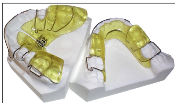
Fig 1. Twin-block appliance.

consequently to have effects on the craniofacial growth. 14 Gresham and Smithells 15 and Morris et al 16 revealed radiographic evidence that children who habitually lack an upright head posture have an Angle Class II malocclusion, long-face syndrome, and kyphosis of the cervical spine. In addition, Sidlauskienė et al 17 found that the dental overjet and overbite were significantly greater in patients with kyphotic posture.