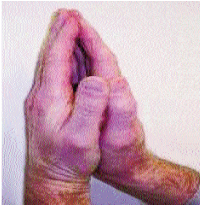
Difficult: When there is a gap between the palms, "Difficult intubation" Easy: When there is no gap between the palms, "Non-difficult intubation"