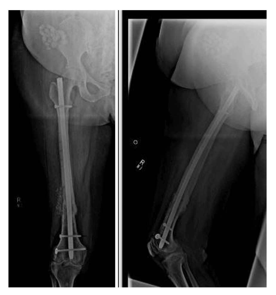
Fig. 1. Post Antibiotics beads x-ray showing the beads in right iliac region and bone graft at fracture site.

O. Hasan et al. / International Journal of Surgery Case Reports 51 (2018) 154–157