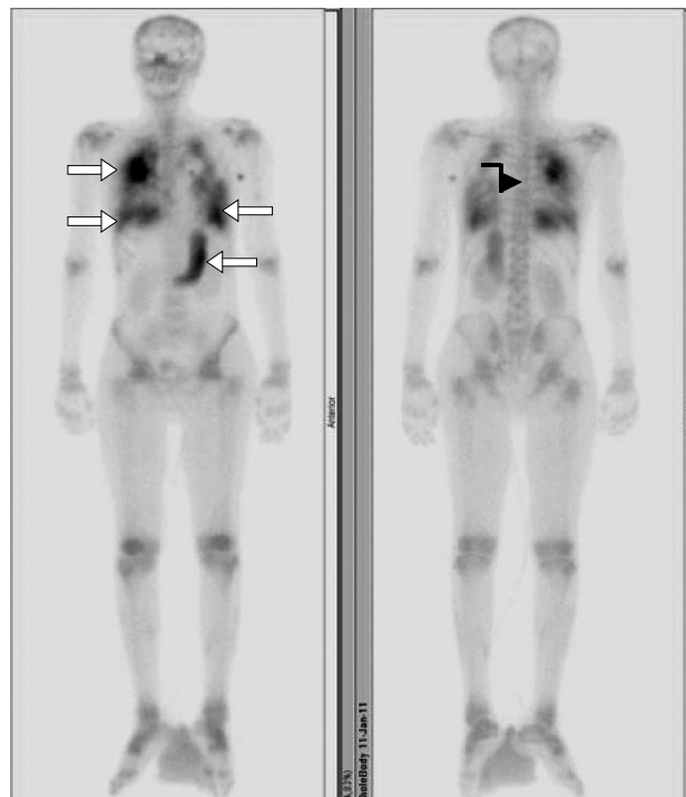
Figure 3: Whole body bone scan (anterior and posterior 3 hr delayed images) showing gastric and bilateral lung uptake (white thick arrows) and an ill-defined photon deficient area (thin black arrow) over T7 region.

showed epidural and para-vertebral soft tissue masses at C7-T1, T3-5 and T7-8 levels with contour abnormality of spinal cord and diffuse signal changes within cord substances. Whole body skeletal imaging(Fig.3)