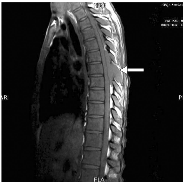
Figure 2: T1 weighted sagittal image (non-contrast) revealing an epidural mass (arrow) extending posteriorly with evidence of cord compression as well.

showed epidural and para-vertebral soft tissue masses at C7-T1, T3-5 and T7-8 levels with contour abnormality of spinal cord and diffuse signal changes within cord substances. Whole body skeletal imaging(Fig.3)