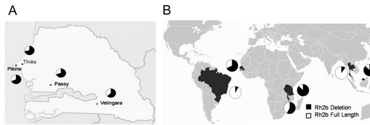
Figure 2. Allele frequencies in Senegal and worldwide

Minimal variation in the frequency of a novel polymorphism in PfRh2b is observed in various regions of Senegal (A), whereas striking variation is observed worldwide (B). PCR typing of genomic DNA from global parasite isolates was used to determine the allele frequencies. This result represents the first comprehensive description of PfRh2b deletion frequency in field-isolated parasite populations.