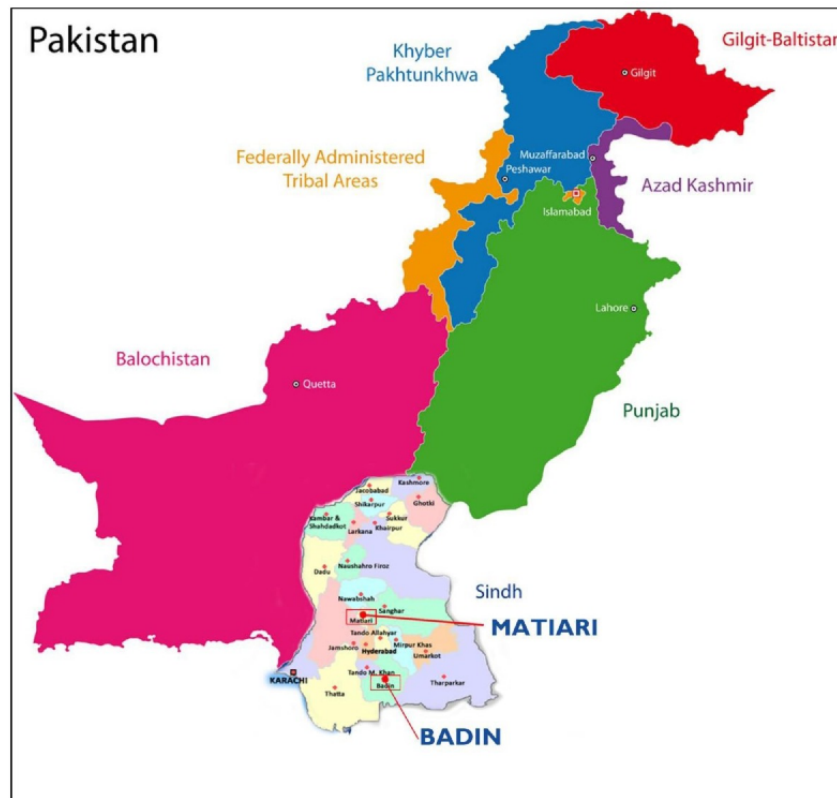
Figure 1. Map of Pakistan showing the districts of Badin (control) and Matiari (intervention) in Sindh province.