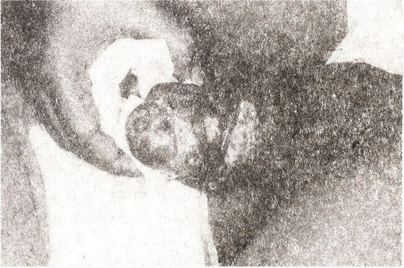
Figure 2. Pre-operative photograph showing the ulcerative lesions on the dorso-lateral aspects of penis. Both lesions were biopsy proven squamous cell carcinoma of penis.

was done to determine depth of tumor invasion and showed no cavernosal involvement. As the disease was confined to the distal shaft, partial penectomy with preservation of 8 cm of un-involved proximal penile shaft and bilateral sentinel lymph node biopsy was performed. The resected surgical margin and both sided Sentinel lymph nodes were tumor free, the final pathologic stage was thus pT2NOMO. At one year follow up, he remained free of tumor with no voiding difficulty.