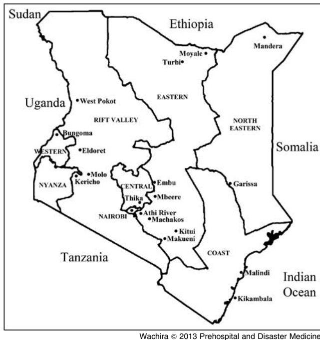
Wachira © 2013 Prehospital and Disaster Medicine