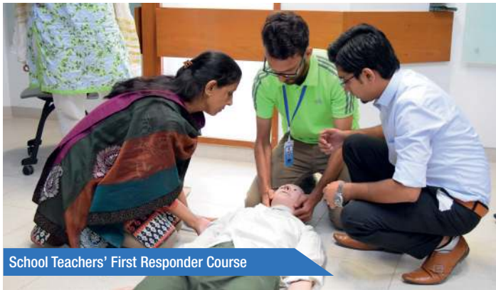
School Teachers' First Responder Course

The School Teachers' First Responder Course was developed to meet the needs of teachers ill-prepared to respond to medical emergencies in the classroom.