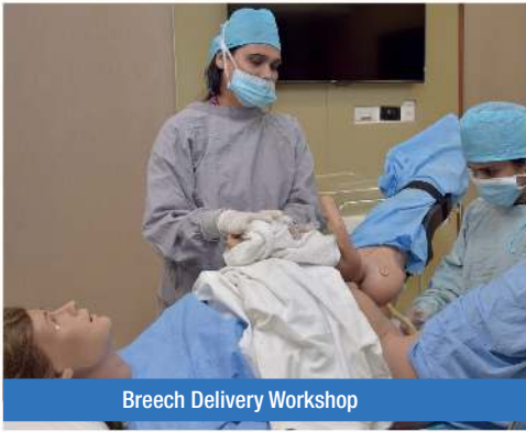
Breech Delivery Workshop