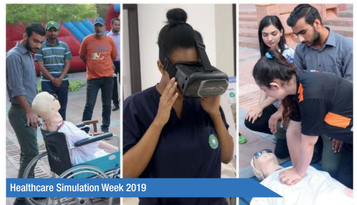
Healthcare Simulation Week 2019

We joined the global simulation community to celebrate Healthcare Simulation Week 2019 , from 16-20 September. The aim was to generate awareness of the importance of simulation in improving the safety, effectiveness, and efficiency of healthcare delivery. We arranged the Room of Errors and Hands-only CPR awareness activities. Mr qaSIM also celebrated this week with us by going out of CIME to interact with students and public as he toured AKU in the campus shuttle.