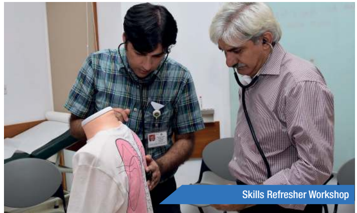
Skills Refresher Workshop

General practitioners from across Pakistan, gathered in CIME for a much needed update in evidence-based practice and the latest thinking in infection control and to rehearse clinical scenarios to strengthen skills in basic life support, suturing techniques, pathological heart and lung sounds identification and managing fractures and other minor injuries that may present at their clinic.