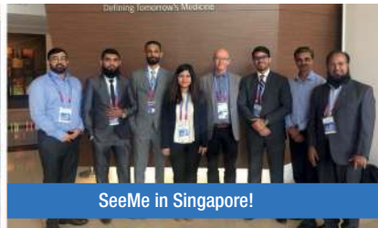
SeeMe in Singapore!