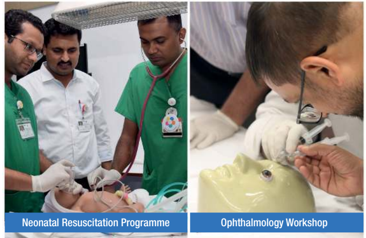
Neonatal Resuscitation Programme

The Pre-Congress Workshops for the 40th Annual Congress of Ophthalmology were successfully held at CIME. Recent advances in ophthalmology were highlighted in this congress by our world class faculty, international & national speakers.