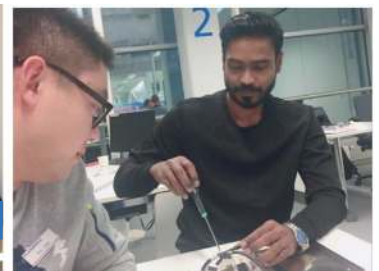
SeeMe in Finland!