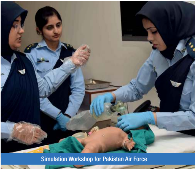
Simulation Workshop for Pakistan Air Force