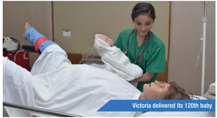
Victoria delivered its 120th baby

Victoria has been a great help in standardizing the teaching of the birthing process in more than one sense pushes students to deliver!