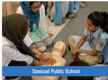
Dawood Public School