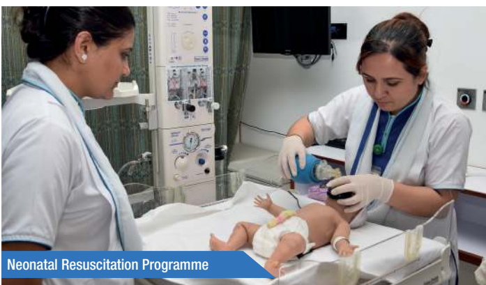
Neonatal Resuscitation Programme

To improve practitioner skills in supporting neonatal care, doctors and nurses from the secondary hospitals of Aga Khan University - Garden, Karimabad, Kharadar, and Hyderabad - attended an NRP workshop in CIME and practiced situations that in real life often have serious consequences if not rehearsed regularly.