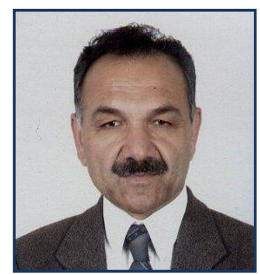
ZEENAT SHAH PROFESSIONAL DEVELOPMENT CENTER NORTH AGA KHAN UNIVERSITY PAKISTAN