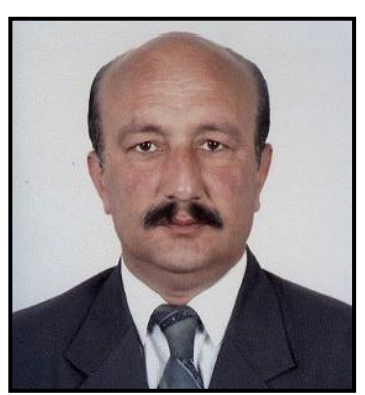
SHARIFULLAH BAIG PROFESSIONAL DEVELOPMENT CENTER NORTH AGA KHAN UNIVERSITY PAKISTAN