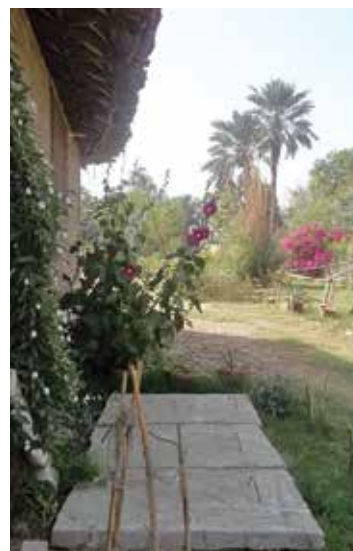
Hollyhocks outside of soak pit

steeped roof, overhang shaded walls to save being baked in constant sunlight thus keeping the interior five degrees cooler than the outside -in summer- till dusk, when temperatures even out and cooling starts immediately as our roof is made of insulating cane fronds. And roshandans keep rooms ventilated and cooled using physics (hot air rises, cool air falls, high ventilators pulls warm air out and cool air in at ground level) without resorting to ACs or even fans - well, that's pushing it, we do have UPS and battery fans for when a high air pressure stillness halts the wind -rarely- and temps go over 38C -often. But, no municipal sewage? No problem. Soak pits are better than