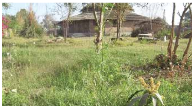
Our house from the young mango tree angle