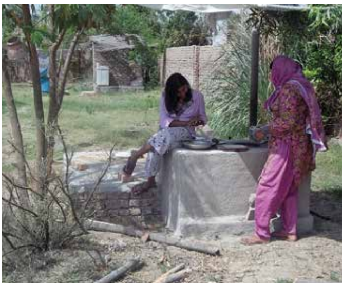
Wood stove and tandoori, part of our renewable cooking

Design, debate, trial and error resulted in adopting indigenous passive cooling technology - going back-to-the-future- to keep cool using a 24 foot high chatai