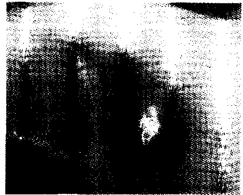
Figure 3: Suppurative BCG lymphadenitis in right axillary region. The lymph node measures 5 cm in diameter, and is fluctuant in centre and the overlying skin is inflamed

(n=4), staphylococcus epidermatitis (n=3), pseudomonas (n=1) and Klebsiella spp. (n=1). Post operatively all the patients were prescribed antituberculous treatment for 6 weeks. Nine patients though advised did not take anti-tuberculosis drugs in postoperative period for various reasons. Two patients had superficial wound infections, and three developed seroma. All patients recovered and did not showed evidence of lymphadenitis or systemic tuberculosis on 6-18 months follow-up.