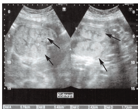
Figure 1: Antenatal ultrasound of a 32 weeks pregnant female. Axial (right) and coronal (left) view of fetal abdomen in lumbar area: bilateral enlarged echogenic .