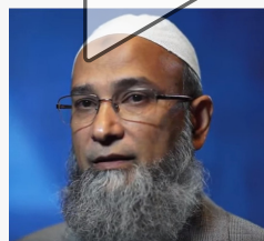
International conference on Fungal Diseases. Amsterdam July 2018