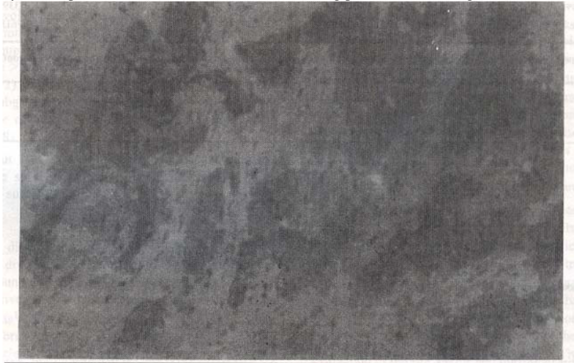
Figure 1. Section of the Carcinoma breast stained with a monoclonal antibody against EGFR. Note strong (+++) membrano staining of all tumour cells. Mag = 20X.

by + mild positive 28 (40%) and +++ or ++++ strong positive 4 (6%) (Figure 1).