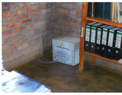
Fig. 1. The left image shows a mail box that is correctly installed, the right image is an example of a mail box on the school library floor.