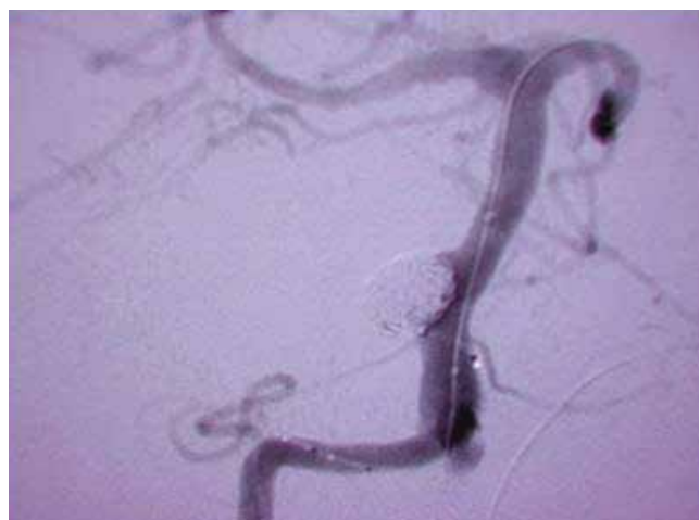
Figure 3. Post procedure angiogram showing complete exclusion of the aneurysm.