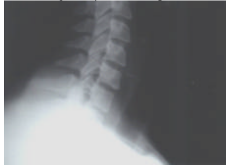
Fig.1: Migrating Foreign Body in the thyroid gland as seen on X-ray

An exploration of the neck was done on this patient and the foreign body was removed from the thyroid gland. The foreign body was a sharp metallic wire.