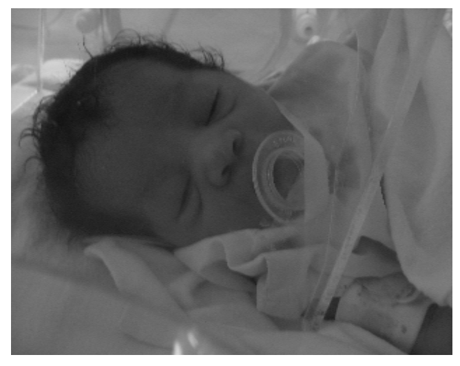
Figure-1: Photograph of baby before the surgical correction showing maintenance of patent airway by means of a pacifier with large bore hole at the end to facilitate breathing through the mouth.