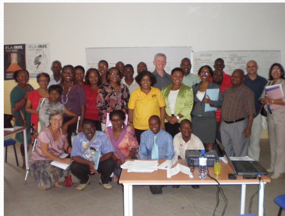
Delegates attending the Public Access to Health Information Workshop in Mozambique, March 2011