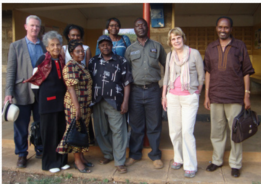
KEN-AHILA members and Public Access to Health Information (PAHI) workshop facilitators. Pilot workshop on PAHI, Kenya, 2009