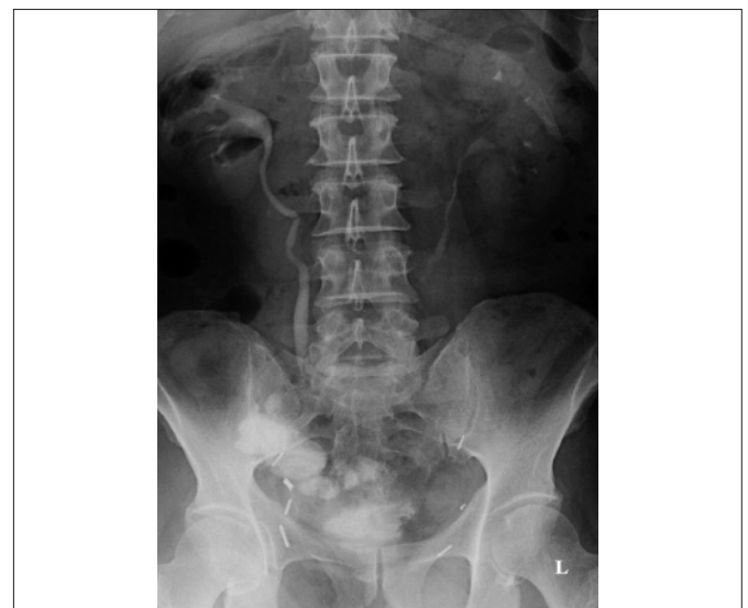
Figure 2: IVU of a patient performed one year after surgery showing preservation of upper urinary tract.