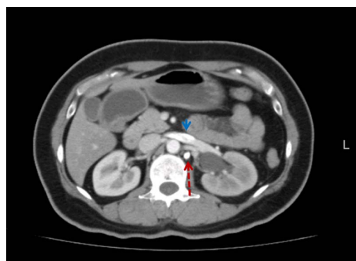
Figure 1 CT scan axial view showing increased contrast density in the hemiazygous (broken arrow) and renal vein (small arrow).

Postangioembolisation the patient remained stable. Her haematuria settled within 24 h of the