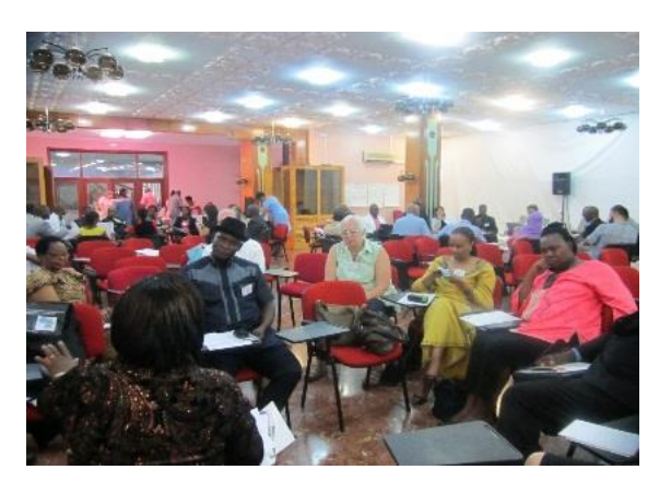
Delegates at work during sessions