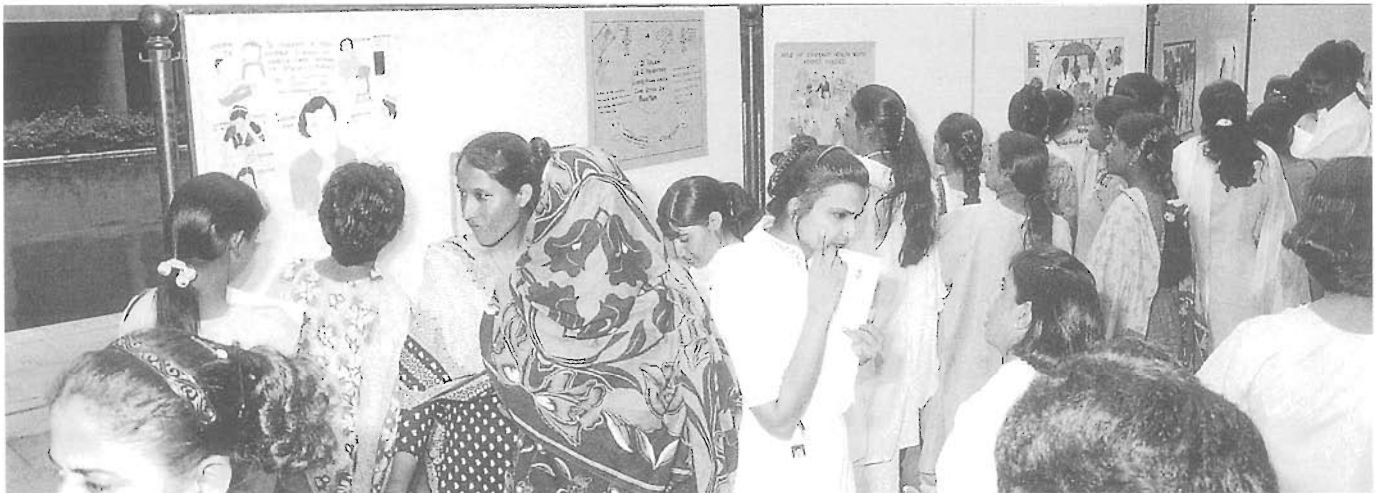
Participants viewing posters on violence against women and nurses, during the seminar on International Nurses Day at AKU.