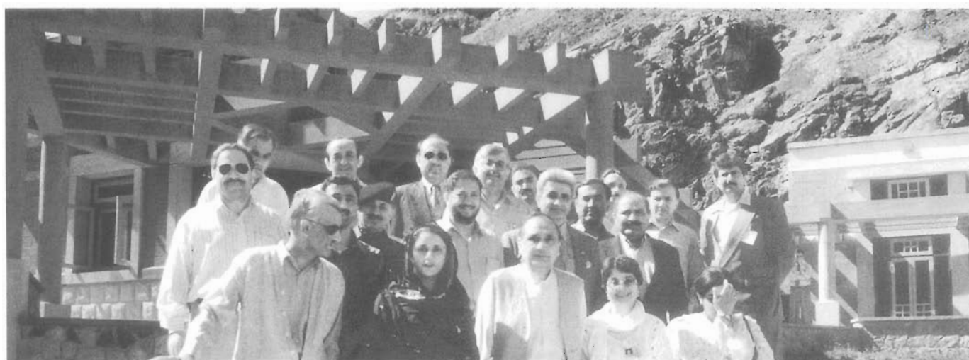
Education Minister Ms. Zobiaida Jalal with a group of Visiting Teachers and graduates at the Professional Development Centre, Northern Areas, Gilgit.

The Minister commended the role of the Aga Khan Development Network (AKDN), which is a group of institutions working to improve living conditions and opportunities in specific regions of the developing world. Ms. Jalal announced that the Federal Government has approved the establishment of an examination board by AKU, and that it is working closely with the University for the improvement of teacher education and the development of a new, improved curriculum.