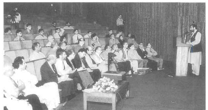
His Excellency the Governor of Sindh, Mohammedmian Soomro, addressing the heads of public and private universities and colleges, heads of selected higher secondary schools and chairs of Examination Boards in Sindh, at a seminar on 'Improvement of Higher Education in Pakistan'.

The seminar in Quetta was held on July 18, 2001 and its first session was presided over by the Governor of Balochistan, Justice (Retd.) Ameer-ul-Mulk Mengal, who assured his government's full support to the Task Force in its efforts to improve higher education. On the conclusion of the series of seminars, and following consultations with Federal and Provincial authorities, the Task Force is expected to submit its final recommendations to the Government of Pakistan in December 2001.