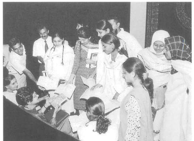
Bapsi Sidhwa is signing her books for enthusiastic students.

Internationally recognised author of English fiction, Bapsi Sidhwa, spoke to a captivated audience on 'Where is Home?' at AKU in April 2001. It was the third in the series of special lectures held by the University as part of its policy of imparting broad-based education to its students, faculty and staff, and giving them a chance to benefit from interaction with outstanding speakers. In the series, AKU invites eminent personalities to shed light on meaningful and challenging topics of public interest. During her talk, Sidhwa suggested that books by Pakistani writers should be included in the universities' curricula.