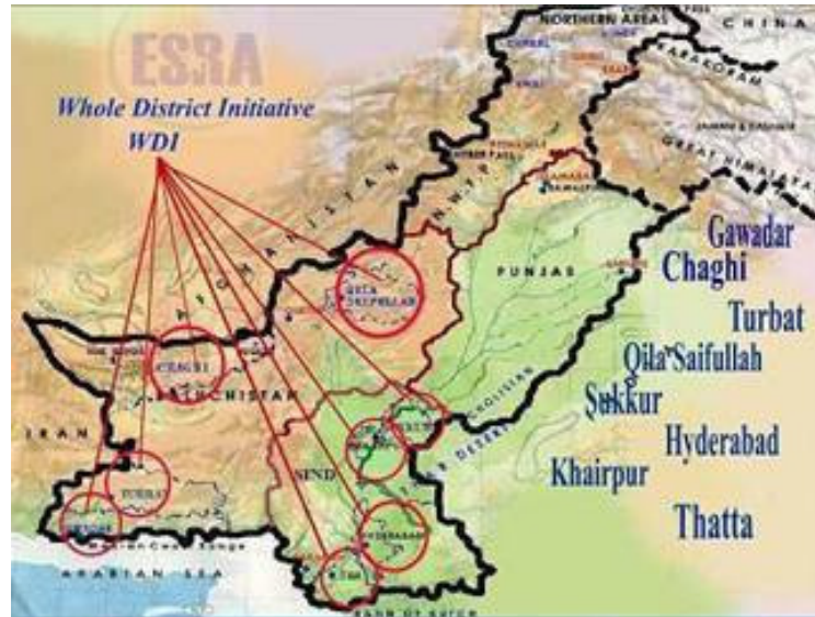
Figure 1: Districts geographical location

A qualitative approach was found to be the most appropriate because data could be collected within a natural surrounding, be gathered by several sources, it was process-oriented, findings could be written in detailed and descriptive manner, and most importantly it would reveal how different people make sense of their lives.