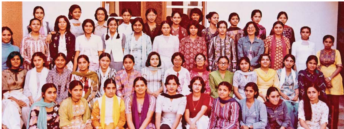
Setting the trend, the first batch of nurses helped transform traditional thinking about the profession