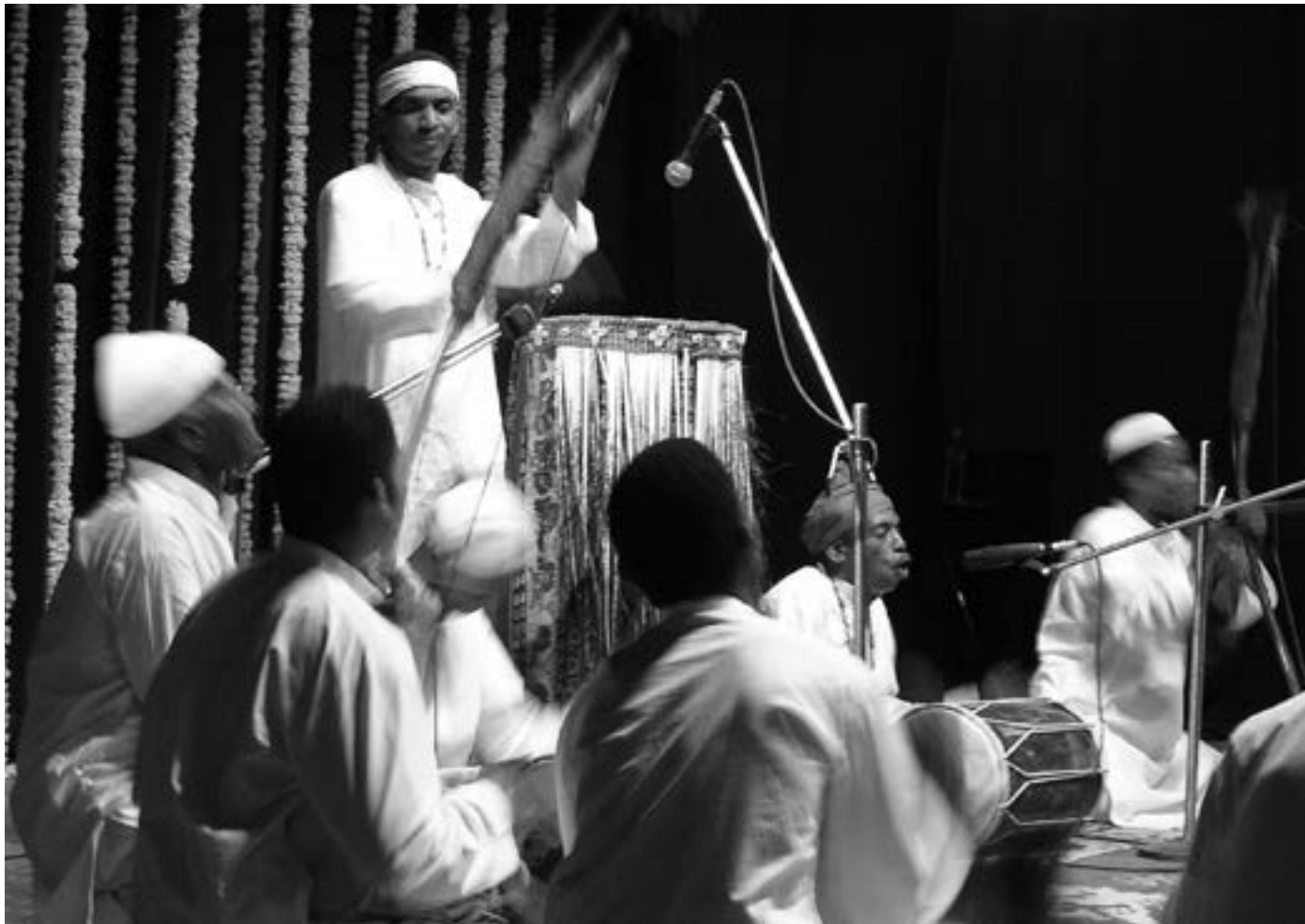
Sidi goma tour in Delhi and Calcutta, sponsored by the Ford Foundation