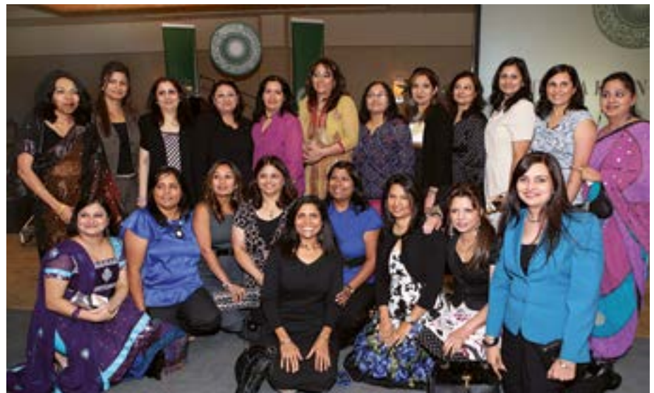
Nursing alumni at the Alumni Reception and Dinner in Chicago on June 11, 2012