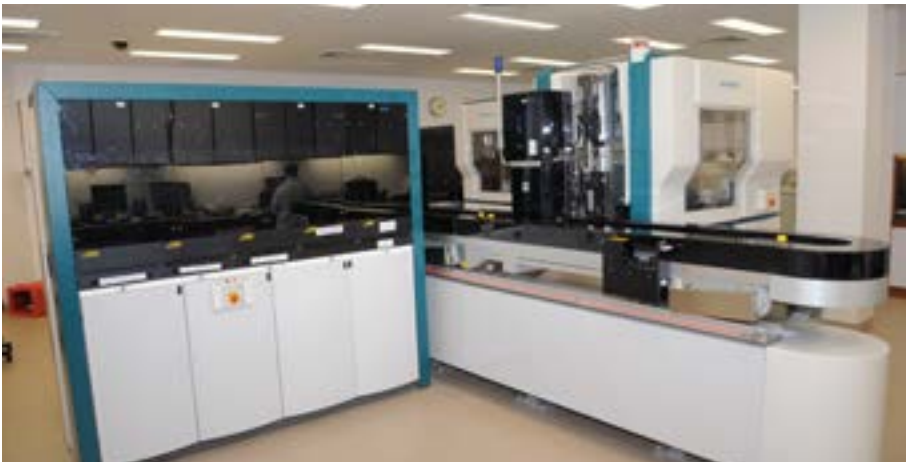
Automated Lab System at the Sopariwala building at Aga Khan University Hospital, Karachi